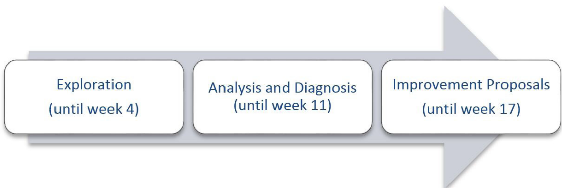
Figure 2. Phases of the project.